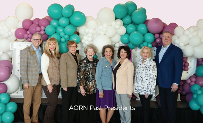
AORN Past Presidents

Proudly supported by North Carolina, South Carolina, Georgia, Florida and Louisiana Councils of periOperative Registered Nurses. Powered by OR Today .